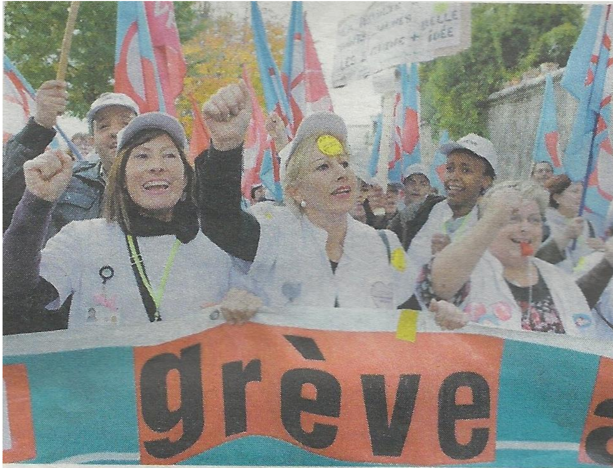
November 2011: On strike